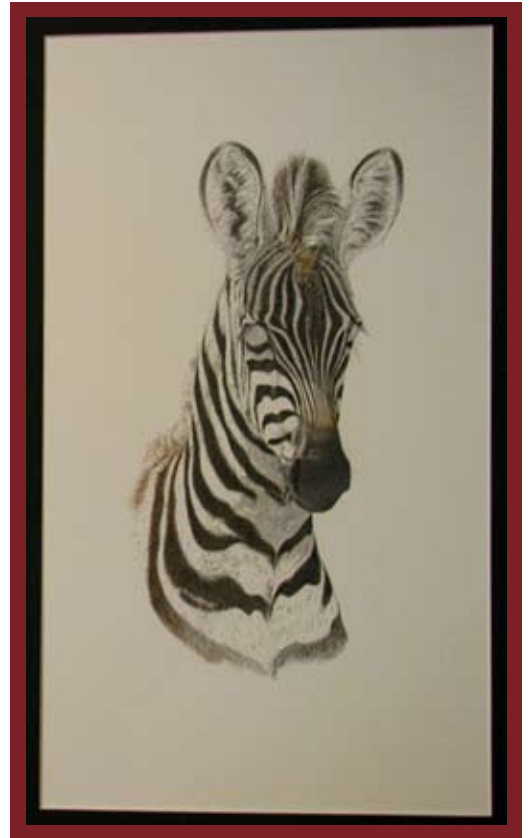
Unfinished Baby Zebra

I don’t know her name yet, but this beautiful little zebra filly frisked in front of us in the Ngorongora Crater. Under her mother’s watchful eye, she tested her new legs and paused to study the vehicle filled with silly people in front of her. Lashes long enough to make even a Diva jealous, she was one of the prettiest little zebra foals I have sketched.