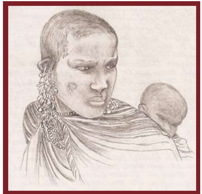
"Maasai Woman" Tanzania Sketchbook '09