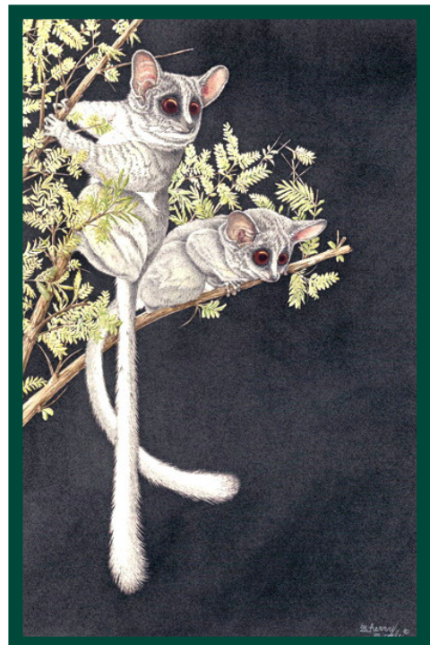
“Pixies Of The Night”

OTHER SHOWS MAY BE SCHEDULED Check website - www.sherrysteele.net