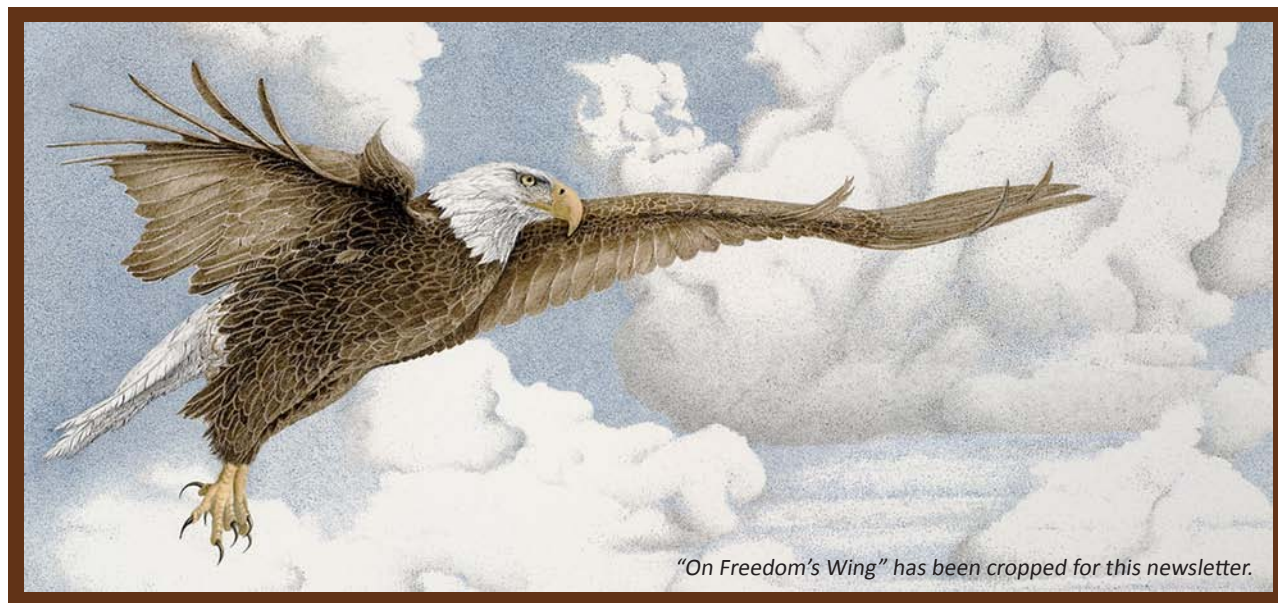
"On Freedom's Wing" has been cropped for this newsletter.