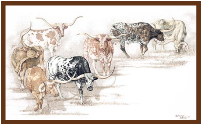
"The Look of Legends"

(512) 892-3553 ssteele@texas.net www.sherrysteele.net