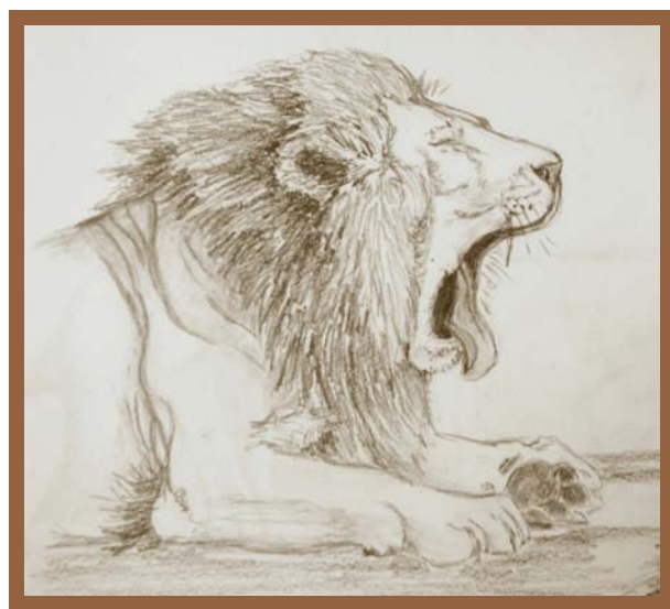
Sketchbook, Tanzania '09

OTHER SHOWS MAY BE SCHEDULED, check - www.sherrysteele.net