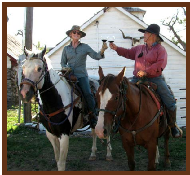
A Toast to YOU!

My charging bull elephant from the Ngorongoro Crater ("When There Were Giants Among Us") tests that will. He is a magnificent symbol of survival from a by-gone era. Building symbol upon symbol, my newly completed American Bald Eagle ("On Freedom's Wing") lifts us to the heights. Speaking louder than words, you can feel the surge of power in the stroke of his wings as he heads into the tempest. He, too, is a symbol and a survivor.