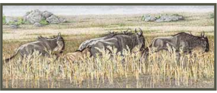
"Perpetual Motion 1"