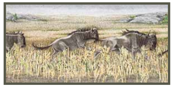
"Perpetual Motion 2"

With long tails flowing behind and white beards glowing in the sunlight, they run. Seemingly without knowing where they are going, instinct pushes them to follow the heels of the wildebeeste ahead of them. This endless cycle of the Great Migration completes a 1,000 mile journey, pauses, and then begins again. Triggered by the arrival of the rains in the Serengeti, the arrival of nearly 800,000 calves within a span of 3 weeks swells the herds. The sight of Wildebeeste running in a steady stream that begins at one horizon and sprints to the other is one of the greatest spectacles on Earth.