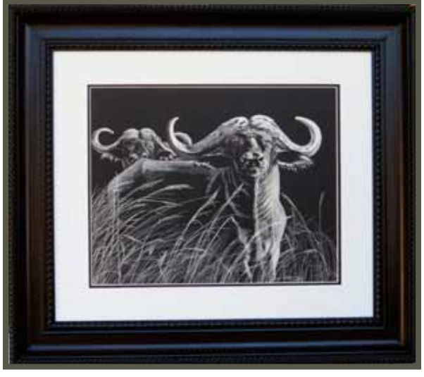
"Got Your Back"

Cautious and rarely sighted, this beautiful little Serval allowed us to join her on an evening hunt in the Ndutu region of the Serengeti. The lowering sun set her exquisite face aglow amongst the reeds as she hunted along the lakeside. Long-legged, with square-tipped ears swiveling at every sound, she located her next possible target more by pinpointing the sound than by sight. Smaller than a bobcat, and a clear target for the larger predators of Africa, it is easy to understand why this was only my 3rd sighting in my 12 safaris to Africa of this captivating little cat.