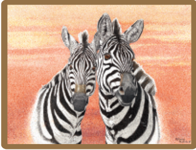
Just Me and My Gal