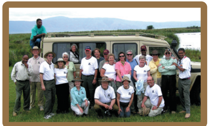
Tanzania Safari Group 2006

My fourth time in Africa was as overpowering as the first. Its timeless mystery is always fresh with new marvels to thrill the senses.