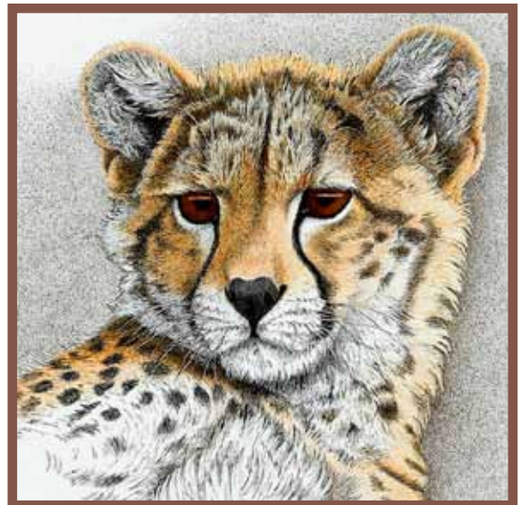
“Born To Charm”

What can’t be foretold is the future of his species as it faces the ongoing slaughter by the illegal ivory trade. My life-long connection with Elephants, beginning with my earliest childhood drawings, leads me to believe I can best bring exposure to this crisis through my art. To that purpose, 50% of all print sales of “Promises” will be dedicated to Ivory Orphans, Tanzania’s first official orphanage for rescued baby elephants.