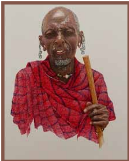
“Wisdom In His Eyes”