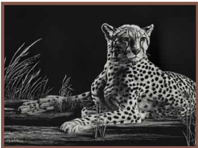
"Siren of the Serengeti"

(512) 892-3553 ssteele@texas.net www.sherrysteele.net