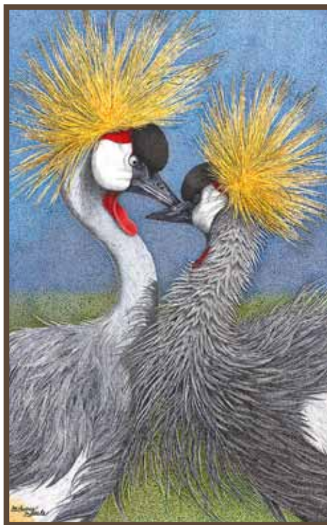
"Let Me Call You Sweetheart"

Please check our website www.sherrysteele.net for our newest items: new tiles, prints on metal, & more.