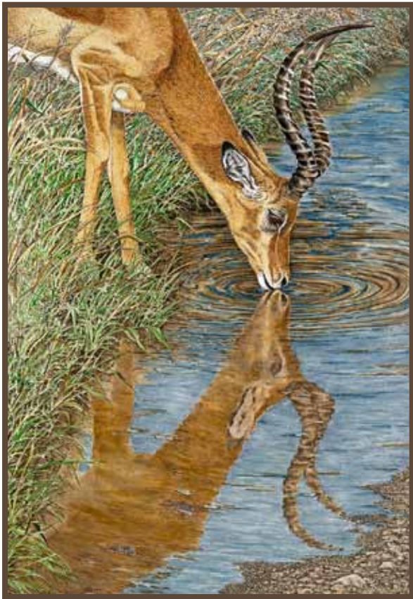
"Beside Still Water"

A brief shower bursting across the Serengeti had signaled the end of the dry season and the beginning of the migration. Already muddied by heavy dust and countless thirsty mouths, a roadside puddle beckoned to yet another. Yielding to his need, the Impala Ram cautiously stepped forward to quench his thirst. Mirroring the beauty of the moment, the Spreading ripples broke the still surface and carried his image across the water. The fun with this piece came when I submitted it to facebook for suggestions for its title. Over 100 suggestions later and the new owners of the Original agreed with me; the clear and fitting winner was "Beside Still Water".